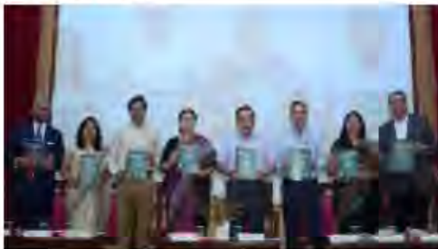
Dr Harsh Vardhan releasing guidelines on nanopharmaceuticals