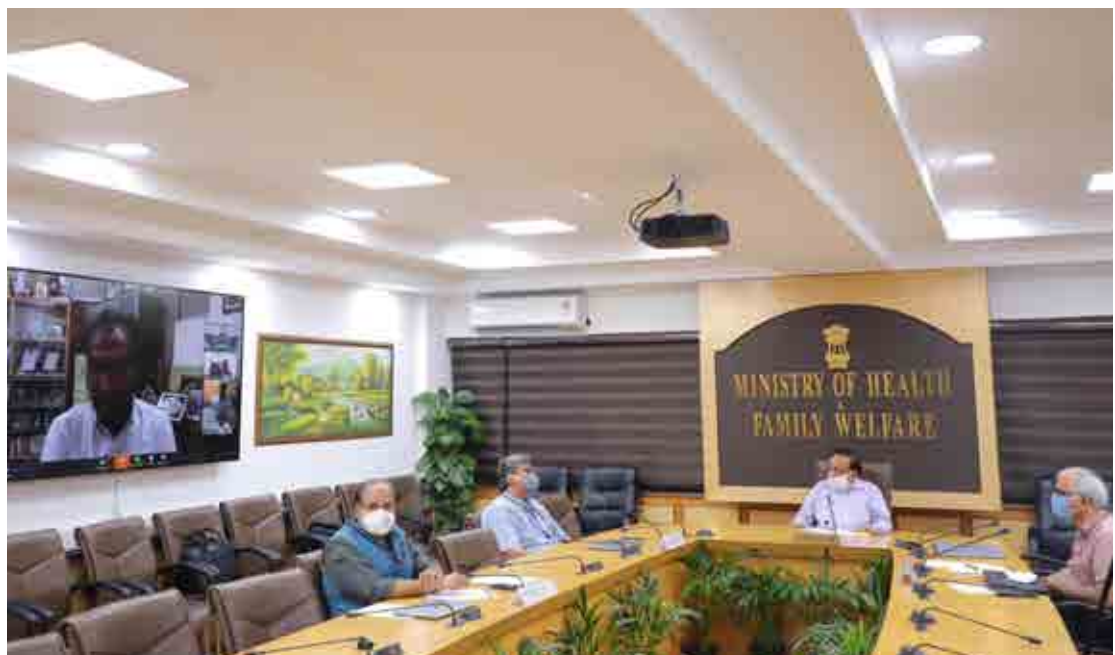
Dr Harsh Vardhan during video conferencing on research and developments initiatives on Covid-19 with the directors of CSIR labs