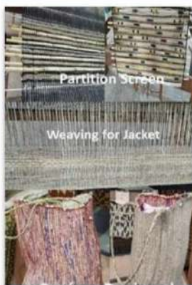
Fig. Handloom Products