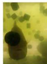
Aquarium after 20days (normal fish feeding & algal growth)