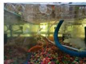
Aquarium with self-cleaning system after 3 months (with normal fish feeding)