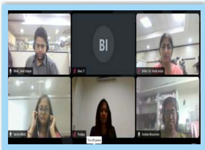
Glimpses of BIRAC IP & Technology Management Law Clinic Connect

BIRAC IP& Technology Management unit has conducted 14th session of IP & Technology Management Law Clinic Connect program on 14th July 2023 via video-conferencing. Experts assisted 6 Start-ups & entrepreneurs in Intellectual property & Technology Transfer related matters. The program was appreciated by all the 6 beneficiaries.