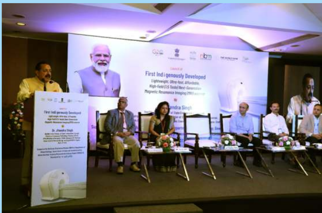
Launch of first Indigenously Developed Magnetic Resonance Imaging (MRI) Scanner by Dr. Jitendra Singh

The Department of Biotechnology (DBT) had launched the India's first indigenously MRI Scanner. The scanner has been developed by Voxelgrids Innovations Pvt Ltd and was supported by the Department of Biotechnology (DBT) through its National Biopharma Mission, implemented by the Biotechnology Industry Research Assistance Council (BIRAC).