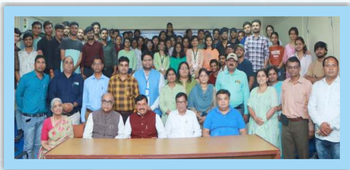
Glimpses of BIRAC sensitization workshop on Bio-Entrepreneurship and Intellectual Property

A one-day workshop on “Bio-Entrepreneurship and Intellectual Property & Technology Management in Life Sciences” was organized by BIRAC & Vikram University, Madhya Pradesh at Ujjain on 28th July, 2023. Hon'ble Minister of Higher Education, Govt. of Madhya Pradesh, Dr Mohan Yadav graced the event.