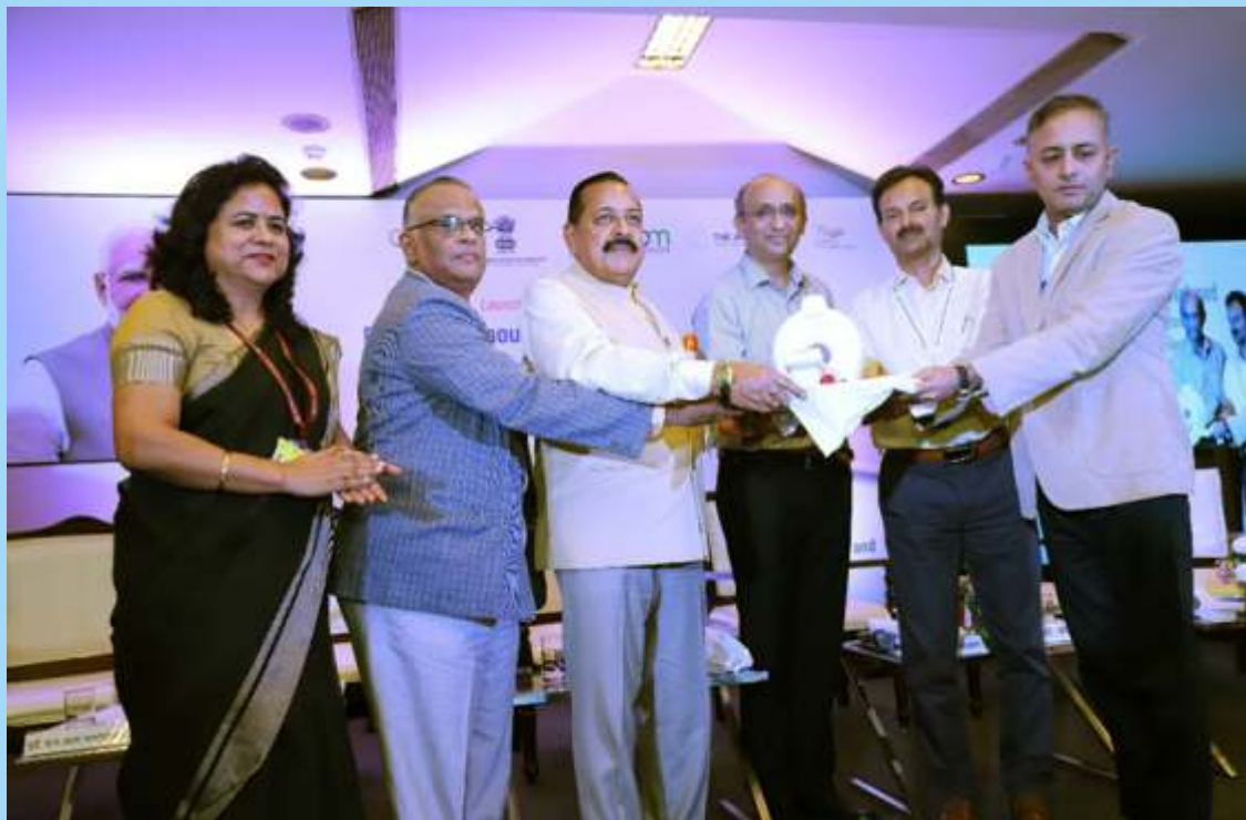
Launch of first Indigenously Developed Magnetic Resonance Imaging (MRI) Scanner by Dr. Jitendra Singh

National Biopharma Mission and BIRAC has been providing support for various innovations in the country and is actively working towards building a supportive enabling environment for greater science and research opportunities in the Devices & Diagnostics ecosystem. The Department has made concerted efforts through adoption of strategies focusing on fostering active partnerships with relevant global leaders and implementation of innovative funding mechanisms. With a view to reduce import dependency, improve affordability and increase the innovation quotient, the Mission is supporting development of medical products in different need sectors. The priority is on the products that are not currently manufactured in India in order to maximize the potential for meeting unmet medical and patient care needs while enhancing maximum potential for market share for its licensees and product development partners.