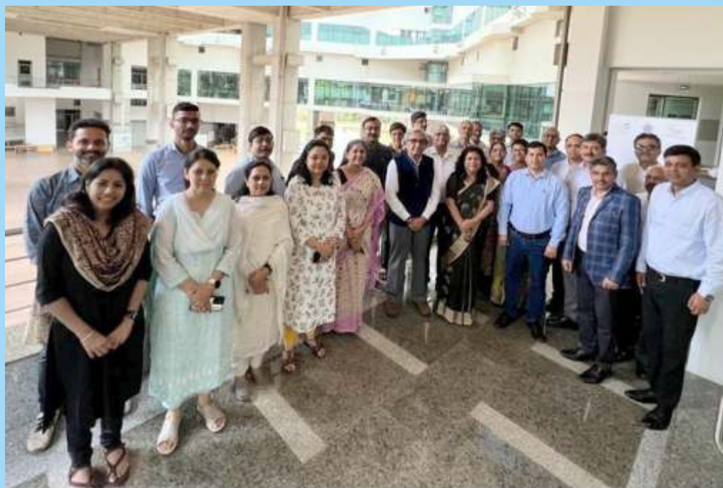
Glimpses of Brainstorming Meeting on Biomanufacturing of 'Enzymes'

The brainstorming meeting on Biomanufacturing of 'Enzymes' was held on 2nd September, 2023 at in Stem, Bengaluru. The meeting was attended by stakeholders, industry experts and representatives from BIRAC. The Stakeholders from academia and industry deliberated on the current status, challenges, and future directions in Enzyme Biomanufacturing sector. The focus of this meeting was to increase/widen the use of enzymes across industries and creating the ecosystem for manufacturing of enzymes in India, which are important to prepare India for a decarbonized tomorrow.