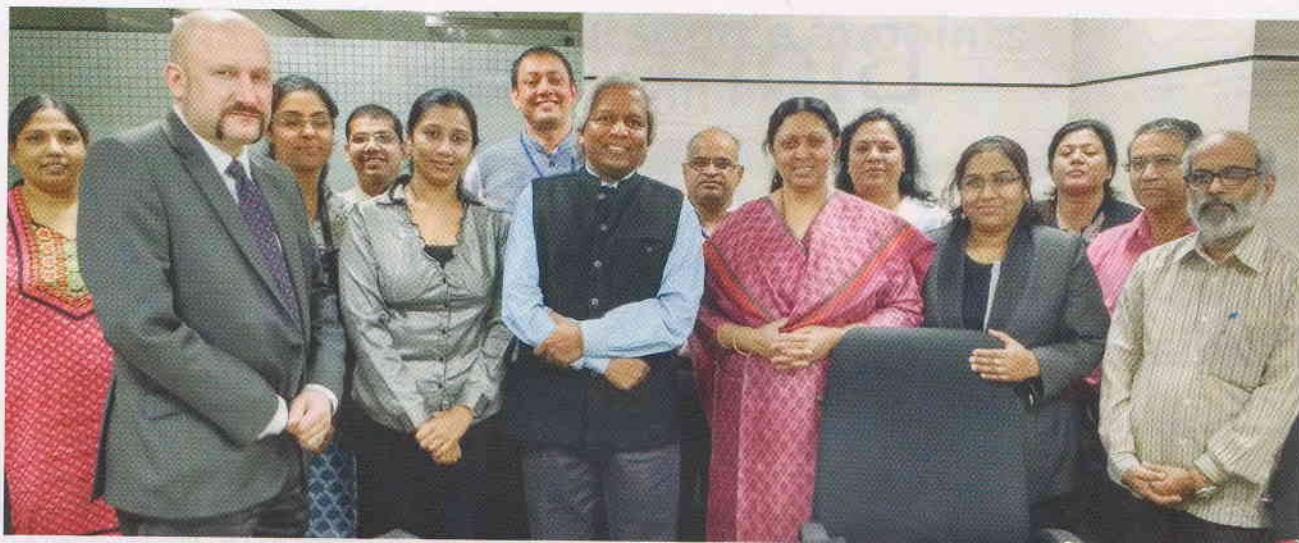
BIRAC last year signed an MoU with UK Trade & Investment, India for boosting innovation capabilities of Indian and British biotech/life science industry

can work with them and leverage that strength. BIRAC is a nimble organization hence where strength exists we look to partner.