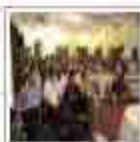
DBT BIRAC Innovators Meet

Biotechnology Industry Research Assistance Council (BIRAC) a Section 25 "Not-for-Profit Company" of Government of India, registered under India Companies Act 1956, has been set up as Department of Biotechnology's interface agency, which serves as a single window for the emerging biotech industries. BIRAC is guided by an Independent Board of Directors comprising senior professionals, academicians, policy makers and industrialists.