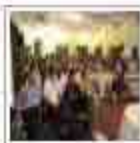
DBT BIRAC Innovators Meet

Biotechnology Industry Research Assistance Council (BIRAC) a Section 25 "Not-for-Profit Company" of Government of India, registered under India Companies Act 1956, has been set up as Department of Biotechnology's interface agency, which serves as a single window for the emerging biotech industries. BIRAC is guided by an Independent Board of Directors comprising senior professionals, academicians, policy makers and industrialists.