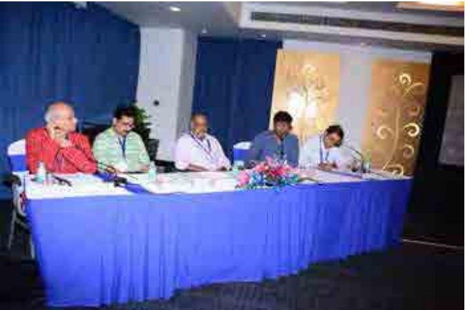
Panel Discussion - Clean Energy: Biotech Solutions for Swachh Bharat - Way Towards Clean Energy