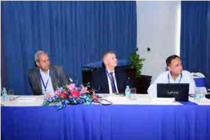
Panel Discussion - Agriculture Electronics: Opportunities in agriculture electronics: revolutionising productivity and quality

‘Precision farming through agricultural electronics’ is a rapidly growing area which is expected to significantly boost agricultural productivity. The panel explored answers for questions such as – What are the new technologies driving precision farming? How are they impacting crop management patterns? What are the issues that impact their adoption? What policy issues will impact this field? After elaborate discussions, following recommendations were made by the panellists: