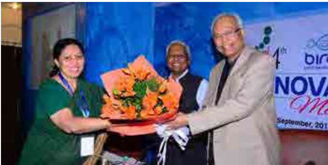
Dr. R.A. Mashelkar at the Meet